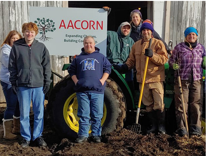
Participants posed with a new AACORN sign that was donated in late fall.

By far, the most exciting development was construction of the new program building. Site preparation work began late in the summer and work continued through the fall. The new building will go into use in 2020 and will feature activity space, a commercial grade kitchen, an office, storage and plenty of room for all things AACORN.