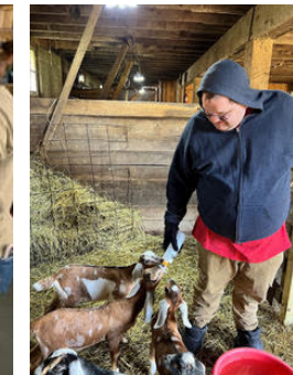
Feeding the kids