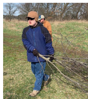
Volunteering to clear brush on MLK Day