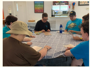
Bingo at the Richland Library

Almost every day of the program, an outing is made into the community. These outings are purpose-driven, like making purchases for the farm animals or for a recipe they are going to make in our kitchen. Examples of other outings include performing a community service activity, depositing rolls of coins at the bank, picking seasonal produce like apples, or simply having fun getting ice cream on a hot summer day.