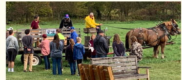
Lining up for a Tillers hayride

hayrides, kids painted pumpkins, and people enjoyed a picnic-style meal while enjoying live music. The Silent Auction offered many great gift baskets for bidding.