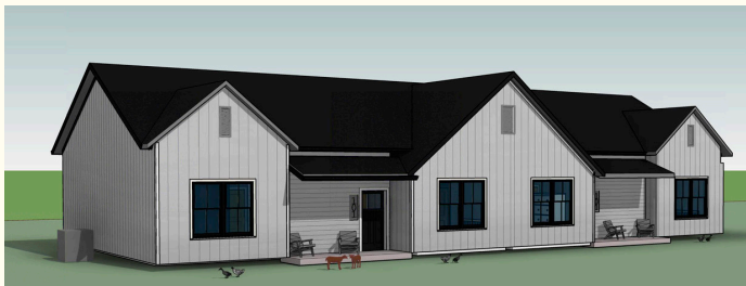
Front and back rendering of one duplex unit