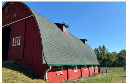
Finished new roof