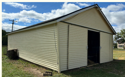
New window, siding & roof