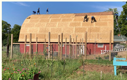
Prepping for new shingles

Nearby, the corn crib got new siding, windows in the back, and a new roof. The corn crib was never used by us for drying corn, but it provides an ideal storage shed and a parking bay for our farm tractor. Both structures are near the entrance of the farm and add greatly to the visual appeal of the property.